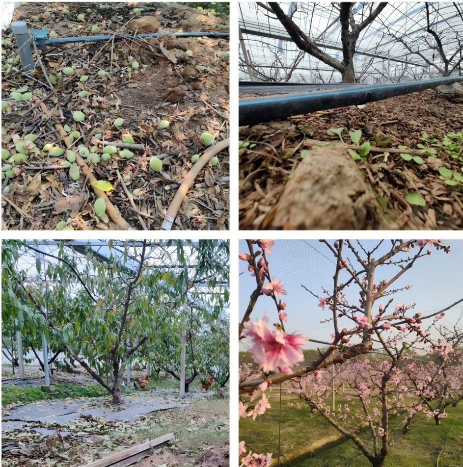
Figure 3 Cultivation and management of peach trees

capable of recycling nitrogen, excessive fertilization does not consistently improve yield or quality, highlighting the importance of precision nutrient management.