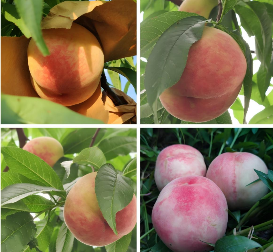
Figure 1 External appearance and visual quality traits of peach fruit

internal quality trait, it is also an important visual cue during purchase. Mechanical firmness measurements are now commonly included in external quality evaluation to distinguish fruit maturity stages such as “ready to buy” and “ready to eat” (Masuda et al., 2023).