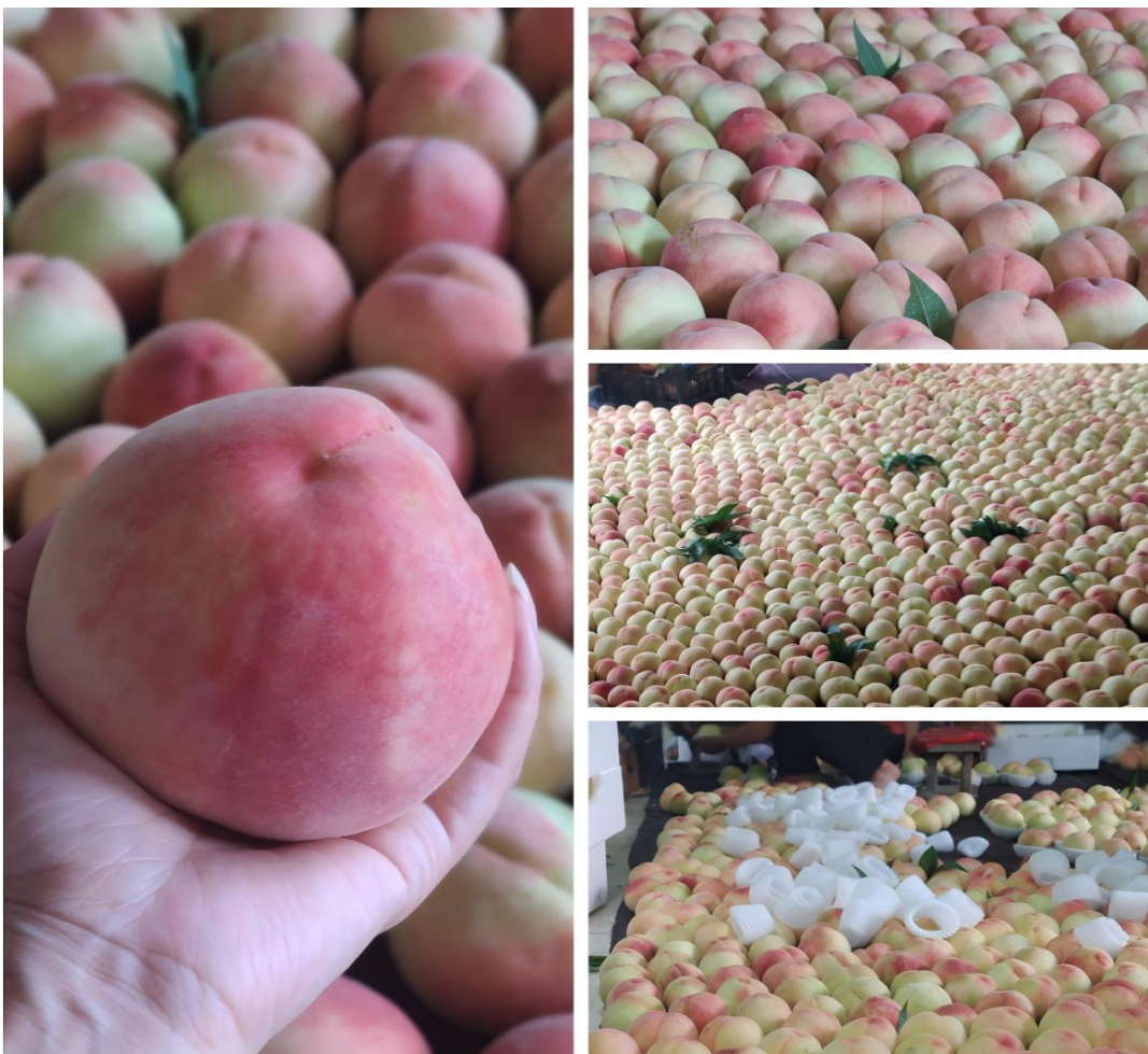
Figure 4 Harvesting stage and maturity management of peach fruit

Harvest timing is a critical factor determining final fruit quality (Figure 4). Since postharvest handling can only maintain rather than improve quality, the maturity stage at harvest directly affects eating quality, storability, and consumer satisfaction. Early-harvested fruits are firmer and more suitable for storage and transport but often have lower SSC and weaker aroma. In contrast, delayed harvest improves sweetness and flavor but reduces shelf life and increases the risk of physiological disorders (Shin et al., 2023). In recent years, non-destructive indicators such as color indices, firmness, SSC, IAD, and DMC have been widely used to determine optimal harvest timing more accurately. This reflects a shift from experience-based decisions to data-driven, multi-index evaluation in harvest management.