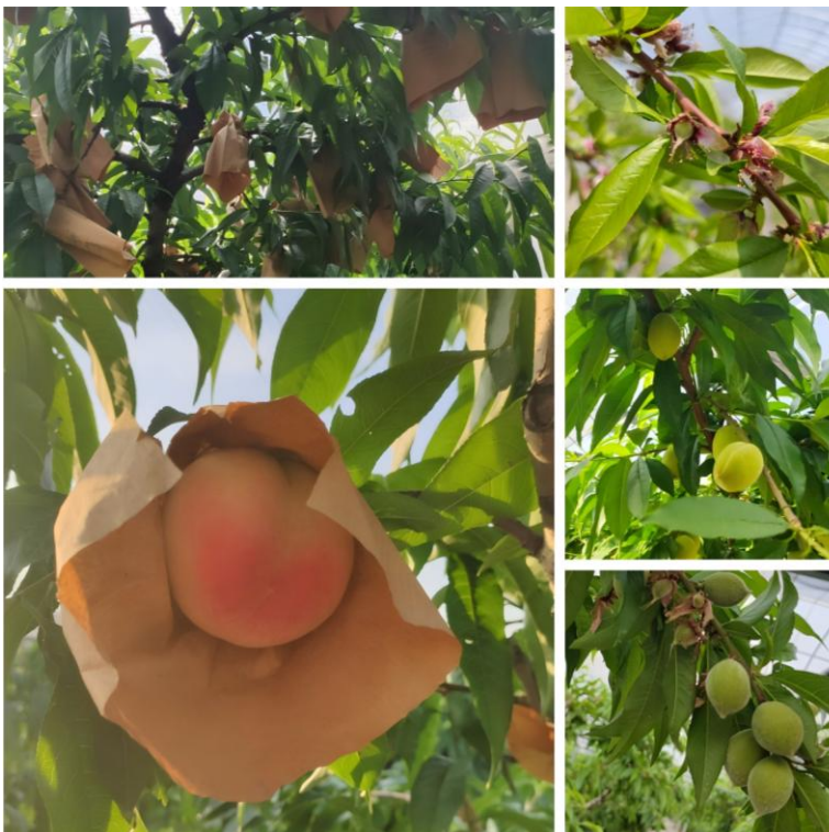
Figure 5 Maturation process of peach fruit

Pigment synthesis and transformation are important physiological bases for external fruit quality. During peach ripening, chlorophyll gradually degrades, while anthocyanins and carotenoids accumulate, jointly driving the peel and flesh color from green to red, yellow, or mixed hues (Figure 5). Anthocyanin accumulation is usually closely related to red peel coloration, whereas carotenoids are more involved in the formation of yellow flesh and peel background color. Studies have shown that, during the color-change stage, key enzyme genes in the flavonoid pathway, such as CHS, F3'H, DFR, and A3GT, are upregulated, thereby promoting anthocyanin biosynthesis and intensifying red or mixed coloration in the fruit (Serrie et al., 2025). In addition to determining yellow coloration, carotenoids can also generate certain norisoprenoid volatiles through the carotenoid cleavage dioxygenase (CCD) pathway, thereby linking pigment metabolism with aroma formation.