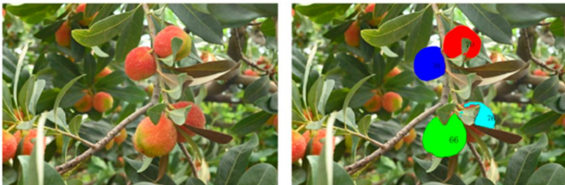
Figure 3 Prediction performance of the regression model (Adopted from Zheng et al., 2025)

Image caption: A simple scenario and a complex scenario with multiple stacked fruits. The predicted maturity percentage is shown above each fruit. Each color represents a distinct instance mask (Adopted from Zheng et al., 2025)