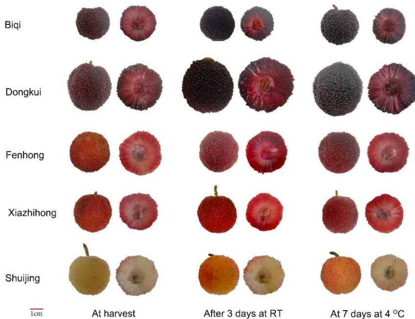
Figure 1 Color development in five cultivars and cross-sections of Chinese bayberry fruits stored at different temperatures after harvest (Adopted from Saeed et al., 2024)

photosynthetic capacity and is unfavorable for fruit enlargement and metabolite accumulation. In addition, appropriate crop load helps maintain tree nutritional balance and improves fruit size, sugar-acid balance, and ripening consistency, whereas excessive fruit load intensifies nutrient competition among fruits, leading to smaller fruits, lower soluble solids, and uneven ripening. Therefore, practices such as flower and fruit thinning, proper pruning, and canopy regulation are commonly applied in production to adjust tree load and improve fruit commercial quality and quality stability.